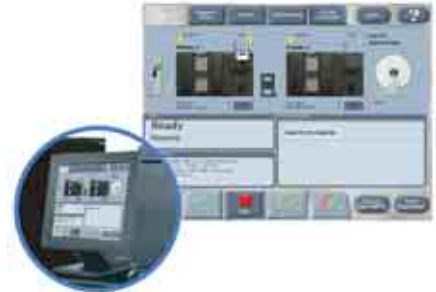
InfoPrint POWER Controller's operator console